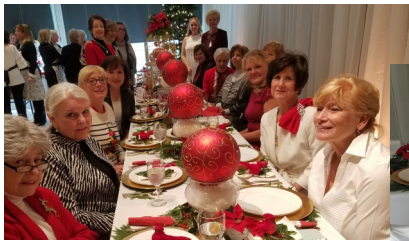
Birds of Winter