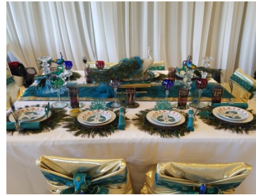
Christmas In India