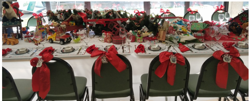
Feliz Naughty Dog