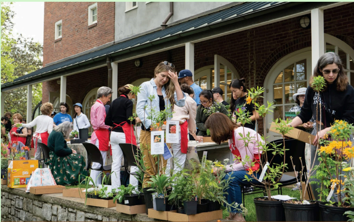
Native plants, flowers, shrubs, azaleas and more!

Available with Gardens Only or Gardens + Mansion Access